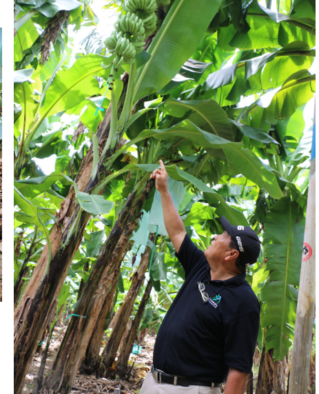
BAR R&D DIGEST