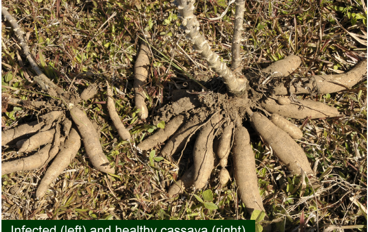
Infected (left) and healthy cassava (right)