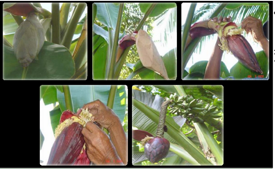
Selected BC1 hybrids were backcrossed to recurrent abaca parents to generate the BC2 populations.

Being implemented by the Institute of Plant Breeding, College of Agriculture of the University of the Philippines Los Baños (UPLB-IPB) with the support of the Bureau of Agricultural Research (BAR), this DA Biotech Programfunded project seeks to respond to both the threat of abaca bunchy top virus and the industry's demand for high fiber quality and yield by developing abaca varieties with high yield potential, excellent fiber quality traits, and virus resistance through the use of molecular marker-assisted breeding techniques.