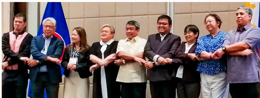
DTI-BITR officials and resource persons during opening program of the workshop in preparation of ASEAN Chairship 2026 at Sheraton Manila Hotel

developments, key focus areas on the country's priorities and legacy projects for its chairship, and lessons drawn from the Philippines' ASEAN chairship experience in 2017.